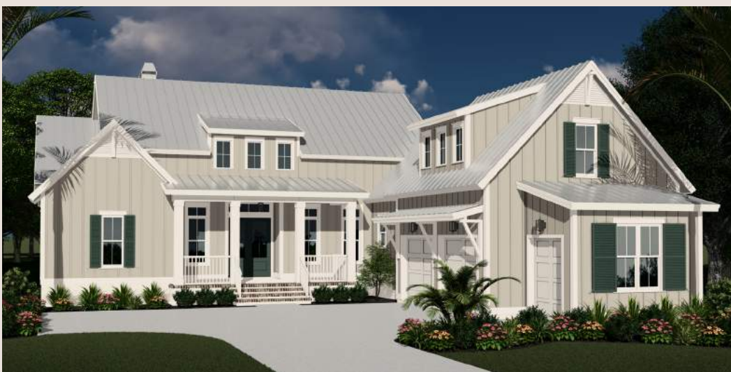
Elevation D – Modern Farmhouse