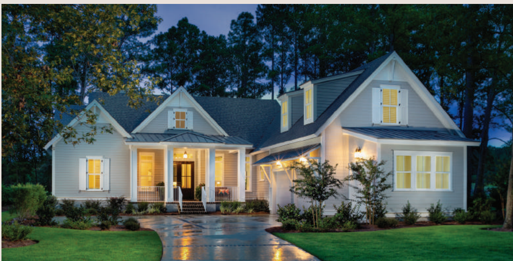
Elevation B – Lowcountry