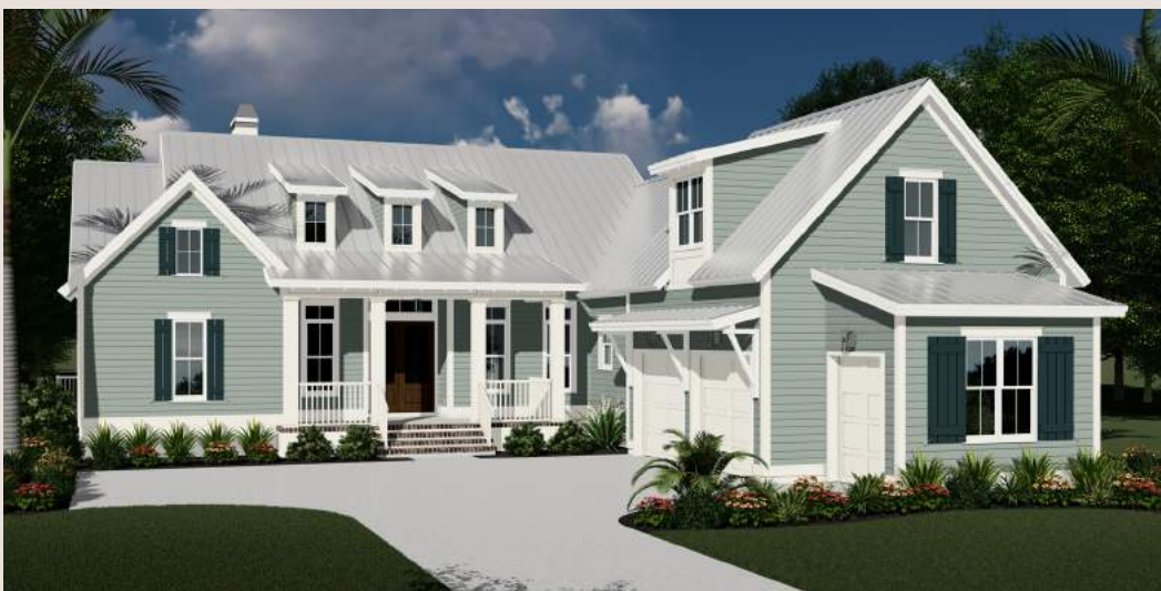
Elevation C – Lowcountry